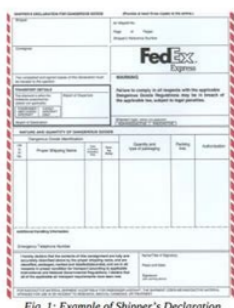
Fig 1. Example of Shipper's Declaration